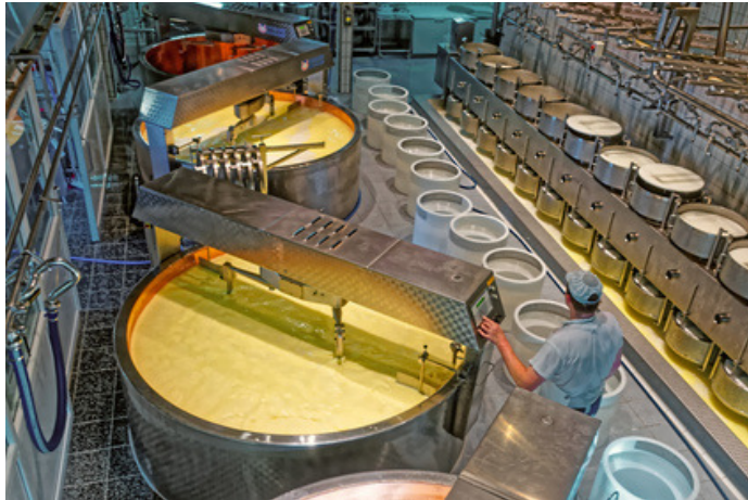
Modern cheese making factories use a high level of automation

This architecture, however, had several shortcomings: due to the continuous expansion of the plant, the load on the Ethernet work had continuously increased and the update times of the Intouch® SCADA system had become very slow. It was not unusual for certain parts of the process to have to deal with update times of 10 to 20 seconds on the SCADA system. This made the task for the plant operators very difficult and had an impact on the production that could not be controlled anymore in an optimized way.