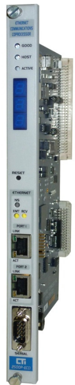
CTI 2500P-ECC1 Ethernet communications Coprocessor

Together with the ECC1 communication card it was decided to replace also the Simatic® 555 CPU's in order to solve problems of obsolescence and obtain a better performance and memory resources. These enhancements were made without having to change any of the I/O's or PLC bases, which made the investment for the customer considerably lower than solutions from other automation suppliers.