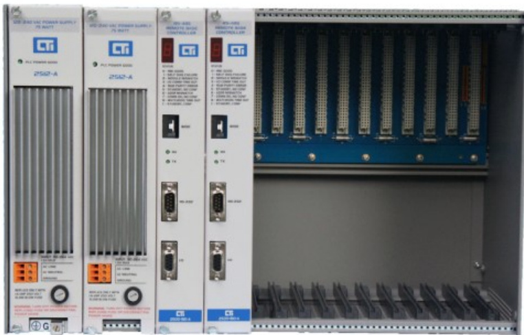
2500-R11 Dual Media Base

The 2515-A Power Supply can be installed in single configurations in standard bases (2500-R4, 2500-R8, 2500-R16-A, 2500P-R4, 2500P-R8, 2500P-R16). For redundancy, 2515-A must be installed in a dual configuration in a 2500-R11-A or 505-6511 base. The two power supplies are installed in the leftmost two slots as shown below. The Power Supply must always be installed in the left-most slot of the system base, as shown in the figure below.