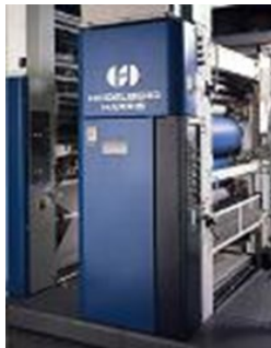
Figure 3: M1000B Printing Press

The plan for Phase 3 was to upgrade the Series 500 I/O to 2500 Series® I/O in either the Classic or Compact size. This phase was planned but has not yet been executed.