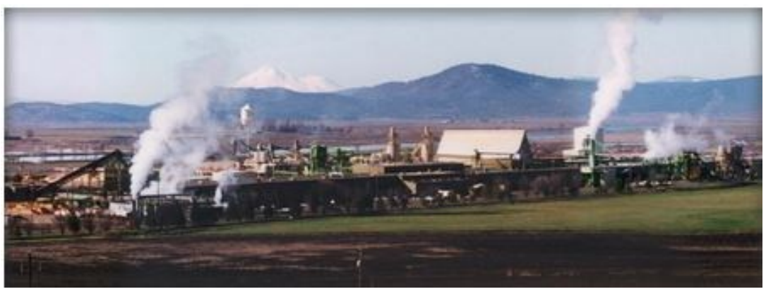
Collins Products' Klamath Falls, OR plant

Copyright© 2019 Control Technology Inc. All Rights Reserved — updated 26JUNE2019