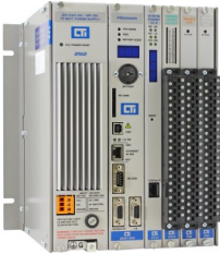
Figure 5: New CTI 2500 Series System

After reviewing CTI's findings and recommendations, plant and production managers had a better understanding of the reasons for the problems they had been seeing with the Ethernet cards. They were also pleased to discover that they could "refresh" and modernize their control systems with no rewiring or reprogramming, little to no downtime, minimal risk and low cost by simply swapping out aging modules for their brand new, updated CTI replacements.