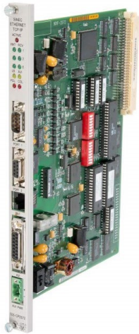
Figure 1: 505-CP2572