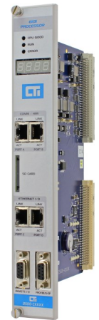
Figures 3 (left) and 4 (right): Simatic 505 system with a 555-1105 CPU; New CTI 2500-C300 CPU